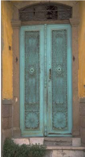
MEMBERSHIP IN A NURSING PROFESSIONAL ORGANIZA- TION CAN OPEN DOORS

Next month November 8-14 th is National Nurse Practitioner week. I am encouraging everyone to take this opportunity to educate the public on our critical role as providers of primary care.